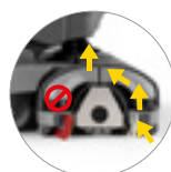
Alternate twin squeegee system (patented)