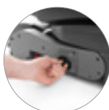
Adjustable down pressure by knob (3 steps)