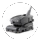
17% recycled plastic