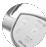
"Silent mode" function